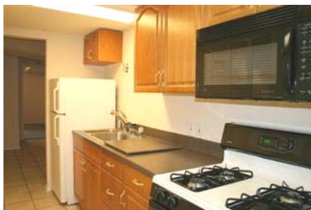
2nd Kitchen in Daylight Basement

Directions: N. of Hill Rd., on Pierce Park, W on Summer Hill Dr.